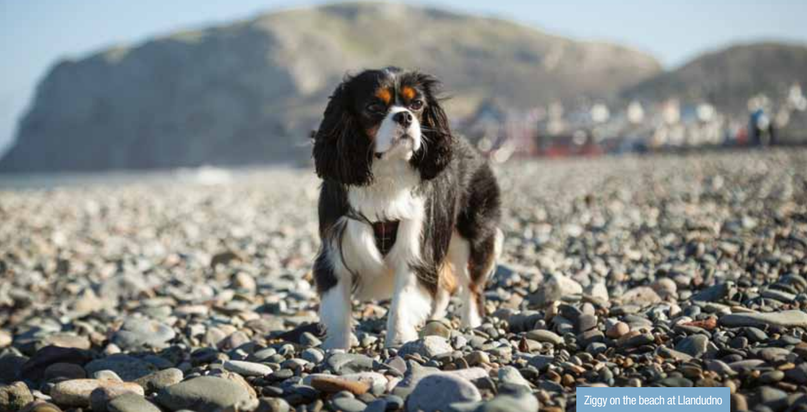
Ziggy on the beach at Llandudno

A Welsh dog who survived horrific injuries following a road traffic accident has won a bravery award